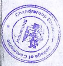
Annexure - First Courses in First Phase