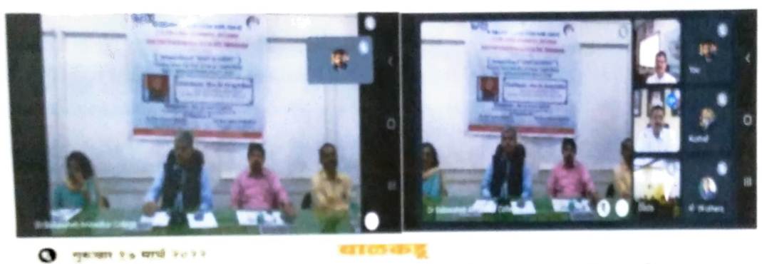
Principal C.D.Jain College of Commerce, Shrirampur