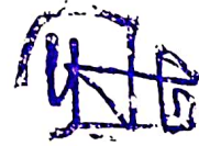
Principal C.D. Jain College of Commerce, Shrirampur